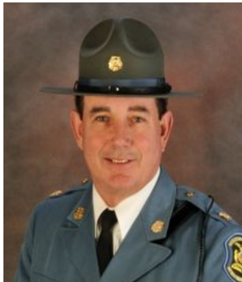
CJIS Systems Officer Major