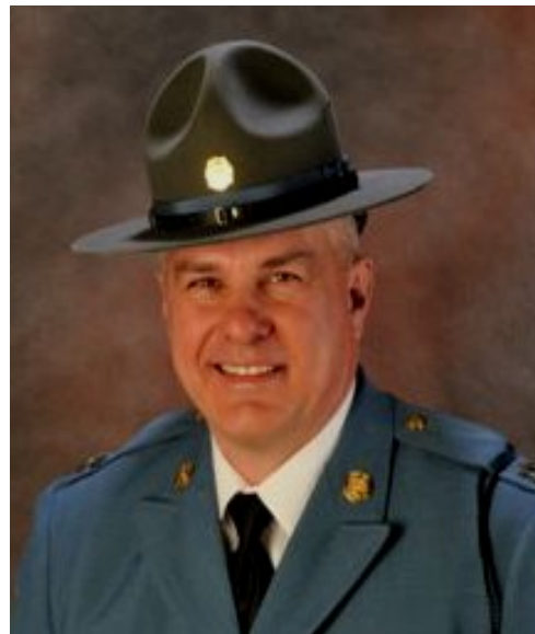
Division Director Captain