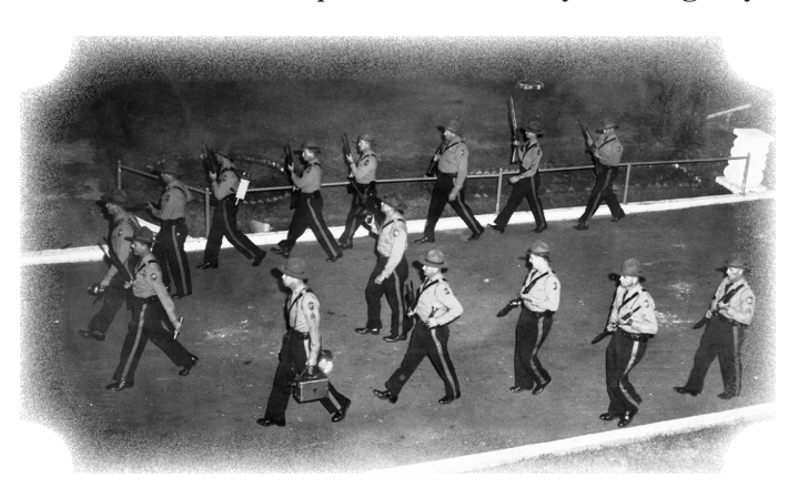
Troopers answered a summons to the Missouri State Penitentiary quickly and acted decisively to quell the riot in 1954. Here, officers prepare to enter "B" and "C" halls to restore order using a wedge formation.

This emergency response plan was the Patrol's first written plan for a specific incident in the event of an occurrence . This initial emergency response plan would evolve and expand over the years into the 644-page, 25 annex Emergency Operations Plan we have today. Originally referred to as the Riot Manual and covering such events in prisons, on college campuses, and in larger Missouri cities, the current plan covers a variety of emergency situations—natural or man-made.