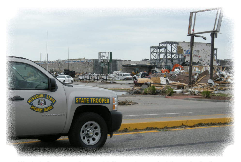
Hundreds of troopers and dozens of civilian employees assisted the people of Joplin after an EF-5 tornado hit in May 2011.

The Patrol's motto of Service and Protection becomes action during an