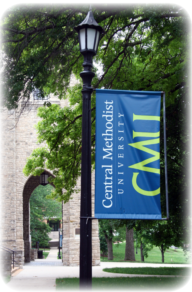
This picture at Central Methodist University was taken near the Cross Memorial Tower near the center of campus.

(Reprinted from Talon Magazine, Spring 2014 issue, with permission from Central Methodist University, Fayette, MO.)