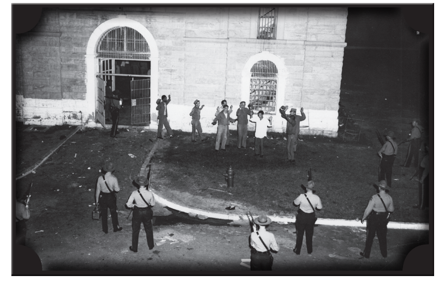
Troopers stand ready to sort a group of inmates outside one of the halls.

Some inmates tried to negotiate the next morning, but were flatly told