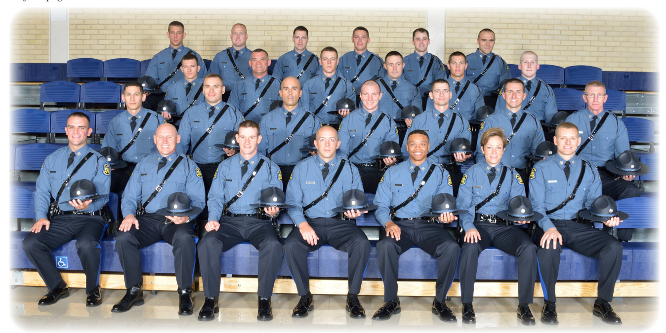
The 102nd Recruit Class is picture.

said. "Some of us were surprisingly old and some of us were painfully young. We learned that we could work together as a team with each of us contributing something to make us successful. We had every difference you can think of, but today we have something in common. Today, we graduate as brothers with one very patient sister. The officers before you will be the pillars