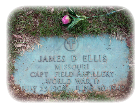
Tpr. James. Ellis' grave is located in Floral Hills Cemetery, Raytown, MO.

On January 7, 1942, one month after the attack on Pearl Harbor and the bombing of the airfields in the Philippines, Japan began the invasion of the Philippines. This act of aggression—the attack on Pearl Harbor—gave the Japanese air superiority over the entire Philippine Islands in one day.