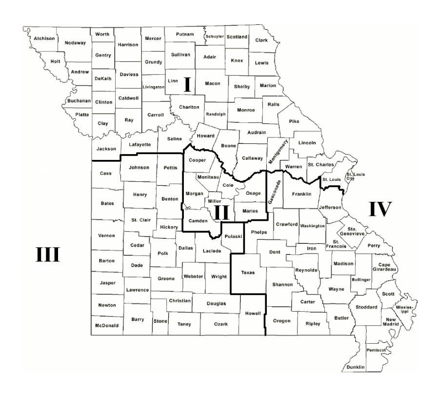
Water Patrol Division District Map, January 1, 2011

On August 1, 2011, half of the Water Patrol Division's District 1 (Troop A and Troop H) was realigned to geographically match those troop areas. Five members of the Water Patrol Division were temporarily assigned to Troops A and H as a pilot program.