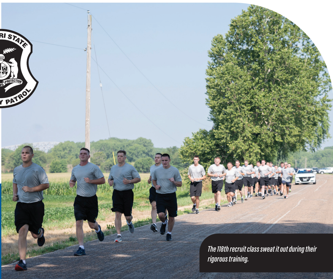
The 118th recruit class sweat it out during their rigorous training.