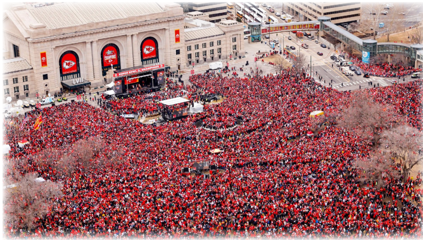
This picture of the Union Station celebration rally provides some idea of how many fans came to celebrate their Chiefs.

The Kansas City Chiefs victory parade welcomed approximately one million people on Wednesday, February 15, 2023. Approximately 50 Patrol personnel were assigned to the parade in downtown Kansas City, MO. At the request of the Kansas City (MO) Police Department, the Missouri State Highway Patrol assisted with pedestrian traffic safety along the parade route. Additional Patrol employees performed other duties such as governor security, emergency operations center overwatch, undercover surveillance, radio communications, and logistical support. The Patrol