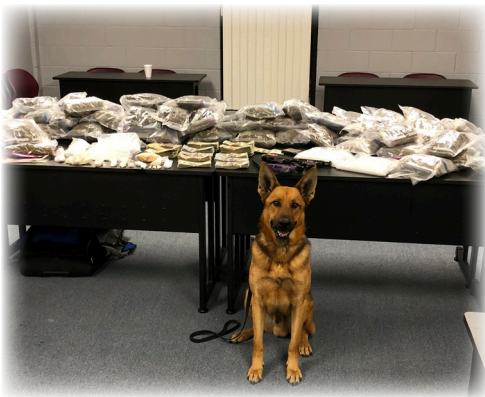
While assisting a local police agency in the execution of a search warrant, Bady located more than 30 pounds of marijuana, a pound of cocaine, six pounds of meth, and a pound of heroin.