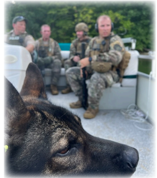
Zsolti deploys with Troop F SWAT to assist with a manhunt in the Troop B area.