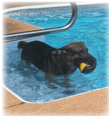
Zsolti knows how to relax.