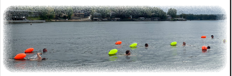
Brightly colored buoys attached to each swimmer's waist helped instructors track their progress.