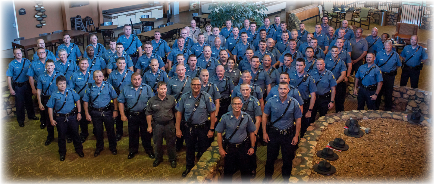
The 2022 Missouri State Fair detail included 86 employees.