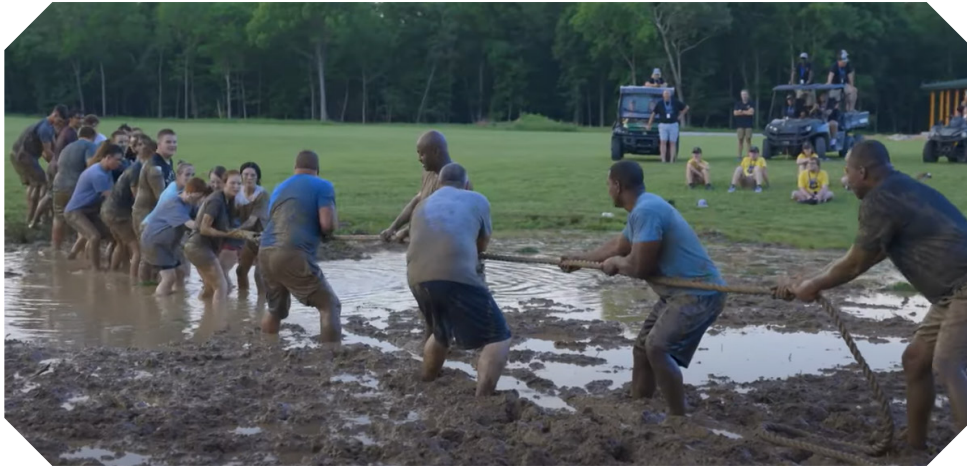
The Patrol members on staff and Youth Academy Program cadets enjoyed a friendly tug-of-war challenge in the mud pit.

This past summer, Recruiting and Community Outreach Division personnel hosted two Youth Academy programs. The first was from May 30-June 3, at Eagle Sky of the Ozarks in Patterson, MO, and the second was from July 28-31, at Camp Mihaska in Bourbon, MO. Between the two locations, 49 students from all areas of the state, ages 16-18, participated in the academies. During each week, the youth were exposed to the various duties and careers available within the Patrol, both member and civilian. They also participated in team building exercises and confidence building challenges, while forming relationships and having fun. Here's what a few of the participants had to say about the Patrol Youth Academy: