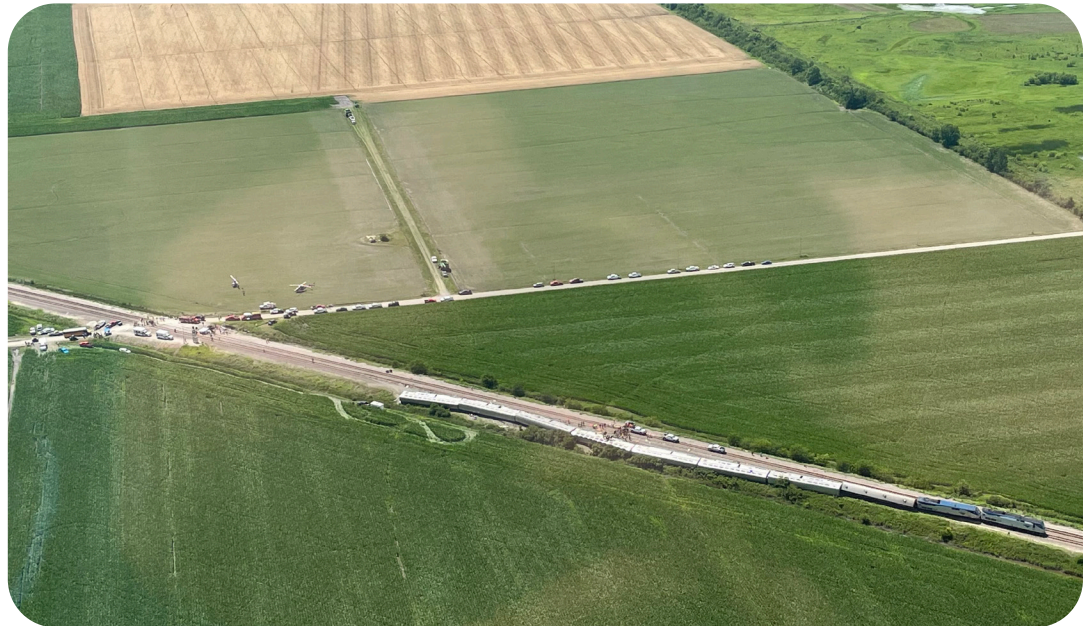
These photos show an aerial view of the derailed Amtrak in Mendon, MO.